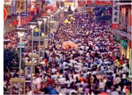
Over the next 40 years, a sea of people will create unprecedented demands to boost food production around the world.

About seven billion people now live on the planet. Over the next four decades, the equivalent of more than one and a half Chinas will be added, and, by 2050, world population will hit nine billion, the Food and Agriculture Organization of the United Nations (FAO) projects.